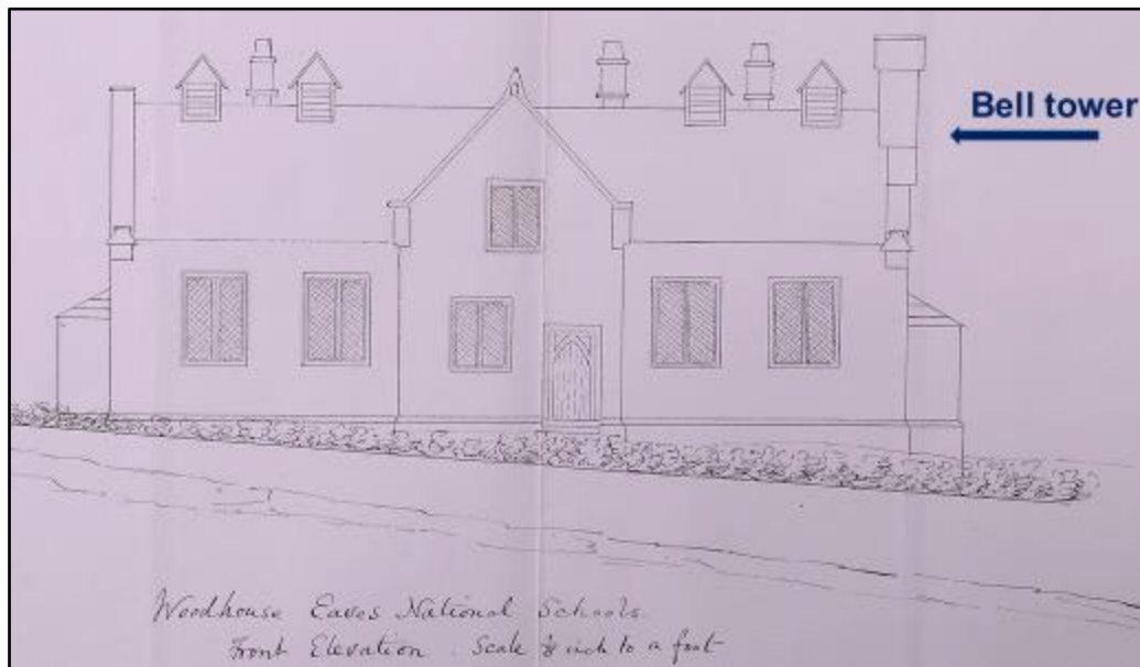
Front elevation of the school – 1838.