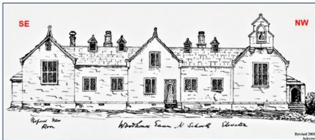
Sketch of the school, extended in the late 19 th century.