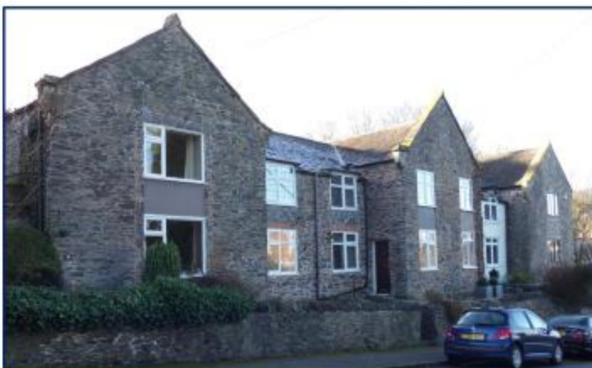
The school today – a terrace of private houses on Church Hill